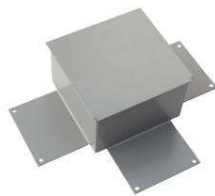
DECOR T-JOIN- "T" join element