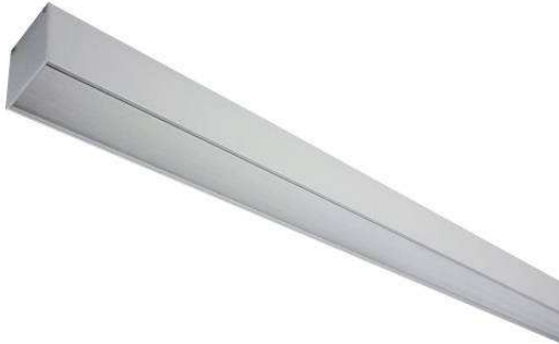
DECOR 128 M82 PRZ