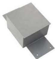
DECOR I-JOIN- "I" join element

Decor fittings have been designed for connection in modern lighting systems with a wide choice of join accessories. Thanks to interesting design and wide choice of optics, they comply with the highest lighting standards and act as an interesting element of interior design.