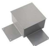
DECOR L-JOIN- "L" join element