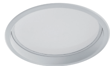
DL 320 LED - mounted in the ceiling